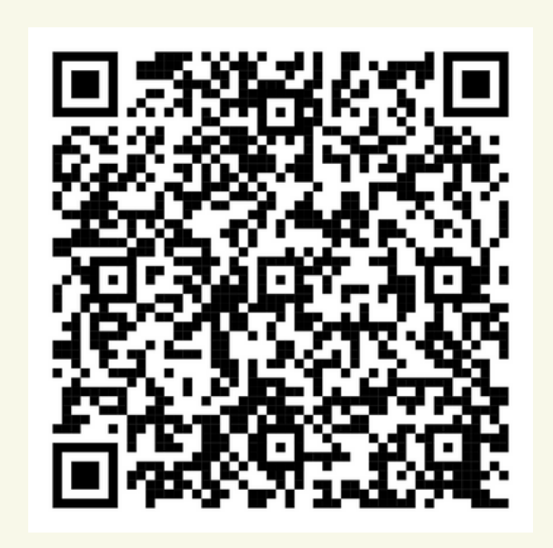
इंदिरा काजू -1 Indira Kaju-1