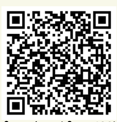
ನೇತ್ರಾ ಗಂಗಾ (ಹೆಚ್ - 130) Nethra Ganga (H-130)