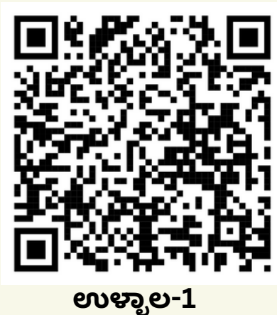
ານ<del>ຍ</del>ູເຍ-. Ullal -1