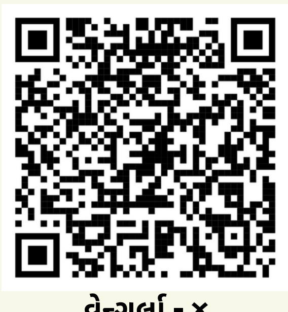
વેન્ગુર્લા - ૪ Vengurla-4