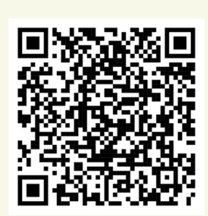
ಮಡಕ್ಕತಾರ-2 Madakkathara -2