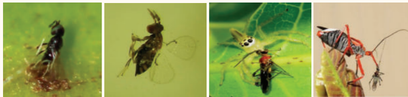
Egg parasitoid - T. cuspsis Egg parasitoid - Chaetostricha sp. Spider- Telemonia dimidiata Simon Reduviid - Panthous bimaculatus D.

Four species of egg parasitoids viz., Telenomus cuspsis sp. nov. Rajmohana and Srikumar (Platigasteridae), Chaetostricha sp. (Trichogrammatidae), Erythmelus helopeltidis Gahan (Mymaridae) and Gonatocerus sp. were recorded on TMB. Among them, T. cuspsis is the dominant one. Besides, nymphal - adult parasitoid ( Leioaphron sp., [Braconidae]), ectoparasitic mite ( Leptus sp.) and nematode parasitoids were also recorded. But, none of these parasitoids are amenable for laboratory rearing. Among the predators; ants, praying mantises, spiders and reduviids also help in minimizing TMB population to a certain extent. Two fungal pathogens viz., Aspergillus flavus and A. tamarii can also cause infection in H. antonii . In most instances, though natural enemies play an important role in control of TMB, they could not minimize TMB population below economic thresholds levels.