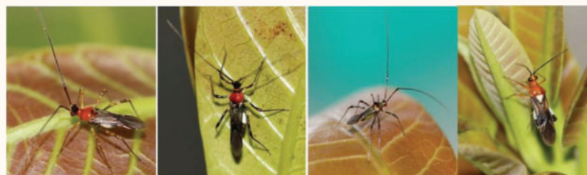
H. antonii H. bradyi H. theivora P. maesarum

P. maesarum : This species lacks the pin like knobbed process, have white scutellum and short antenna.