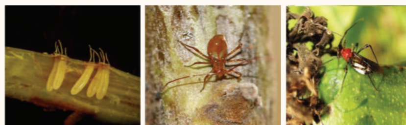
Eggs Nymph Adult